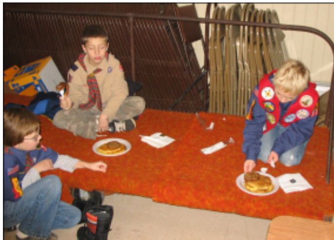
Pancake Breakfast helpers taking a break on the chair rack